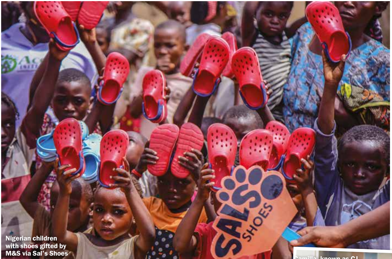
Nigerian children with shoes gifted by M&S via Sal's Shoes