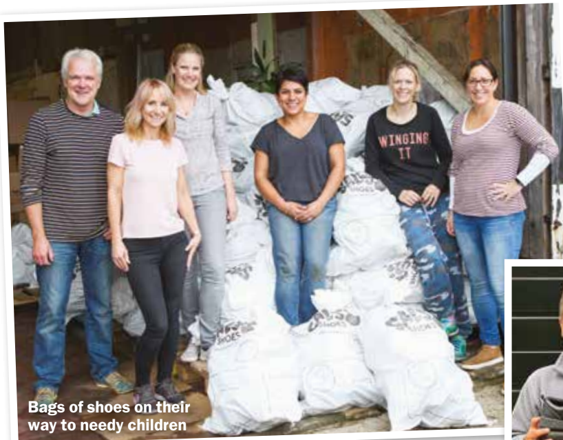
Bags of shoes on their way to needy children