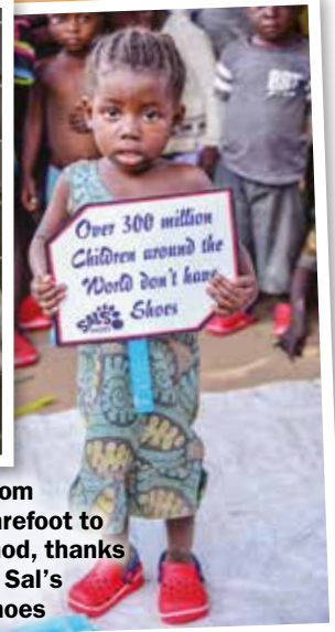
From barefoot to shod, thanks to Sal's Shoes